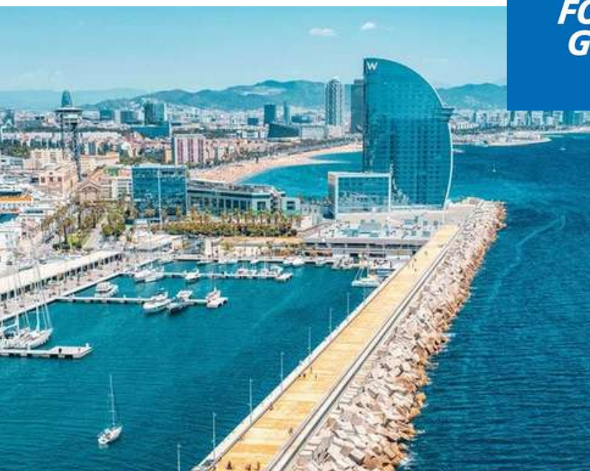
BARCELONA COAST AND W HOTEL