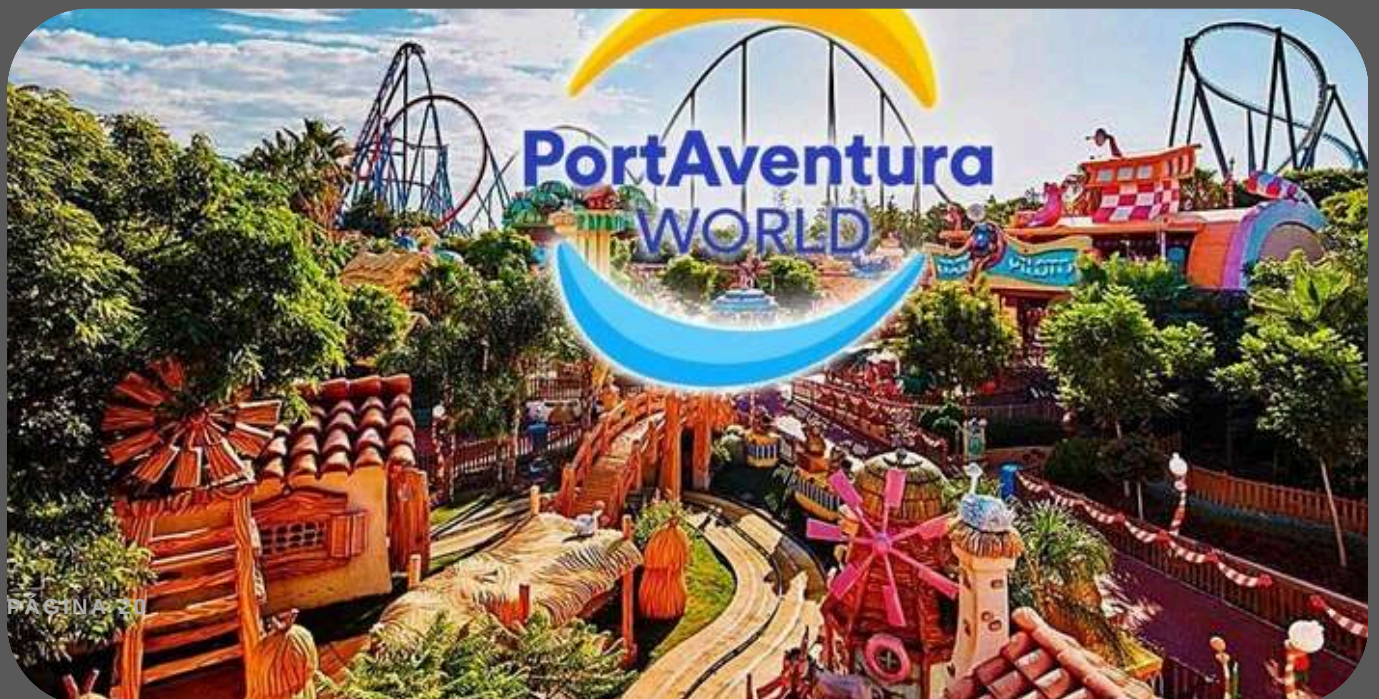
PORT AVENTURA WORLD

The Castellers de Vilafranca were founded in 1948 and they represent the great passion and tradition of their people.