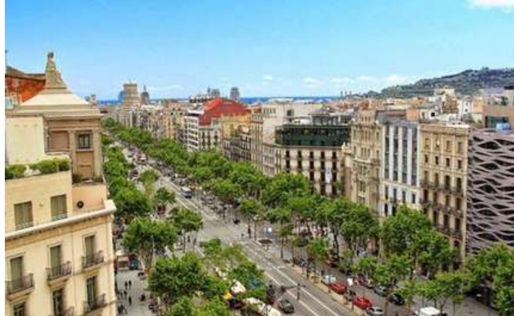
AERIAL VIEW P. GRACIA