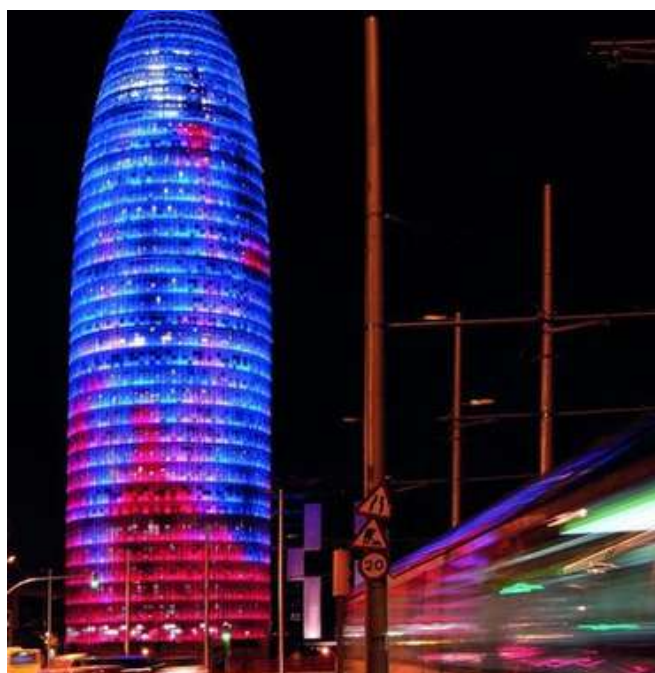
GLORIES TOWER VIEW POINT